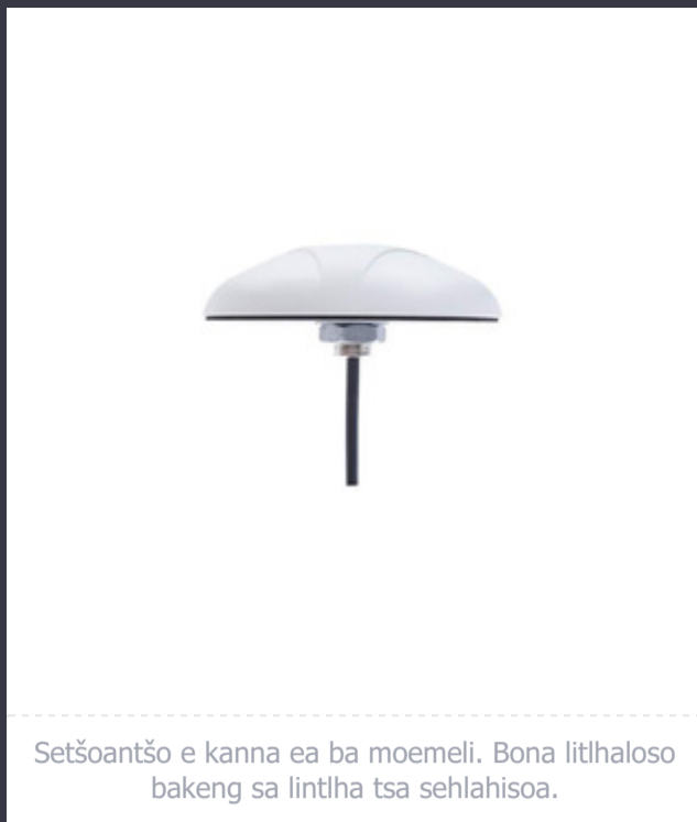
Setšoantšo e kanna ea ba moemeli. Bona lithaloso bakeng sa lintlha tsa sehlahisoa.