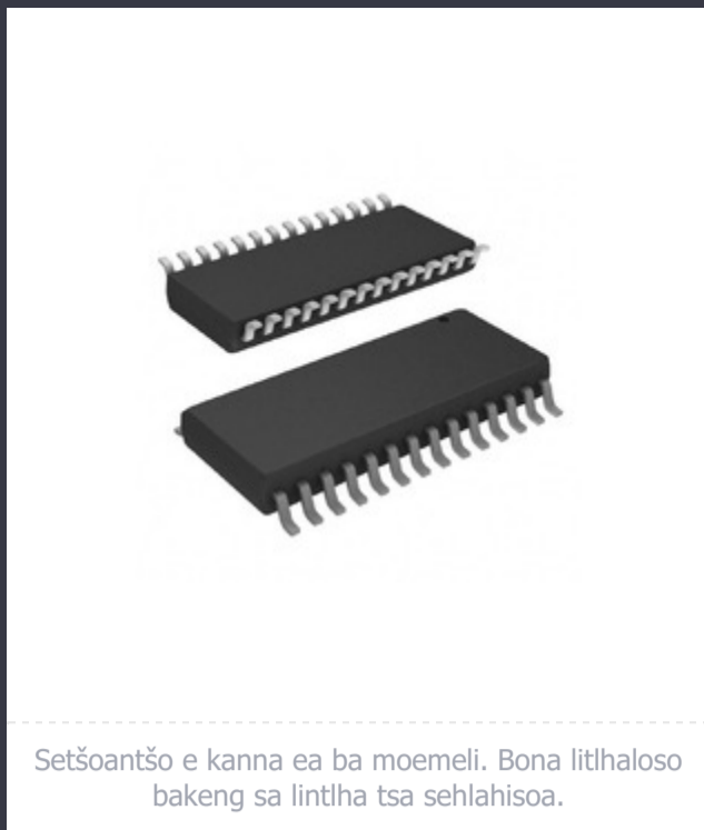
Setšoantšo e kanna ea ba moemeli. Bona lithaloso bakeng sa lintlha tsa sehlahisoa.